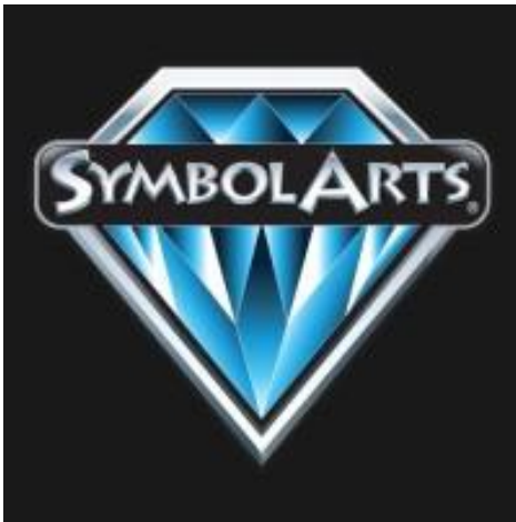
Custom Badges & Recognition Products | Utah | SymbolArts